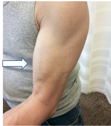
Figure 2a Normal long head of bicep. The muscle has a smooth arc from the shoulder to the elbow

Appropriate rehabilitation is vital to optimizing your outcome after surgery. The rehabilitation guidelines are tailored to the type of procedure performed, therefore below you will find rehabilitation guidelines for soft tissue fixation techniques and rehabilitation guidelines for hardware fixation techniques. The rehabilitation guidelines are presented in a criterion based progression. General time frames are given for reference to the average, but individual patients will progress at different rates depending on their age, associated injuries, pre-injury health status, rehabilitation compliance and injury severity. Specific time frames, restrictions and precautions may also be given to protect healing tissues and the surgical repair/reconstruction.