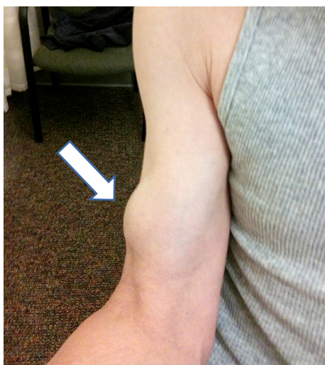
Figure 2b and Figure 2c Torn long head of bicep. The muscle has retracted toward the elbow